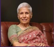
Padma Shri Anu Aga Former Chairperson Thermax