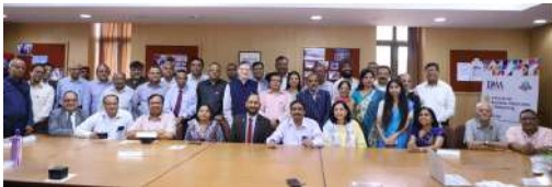
Glimpses of 68 th Annual General Meeting