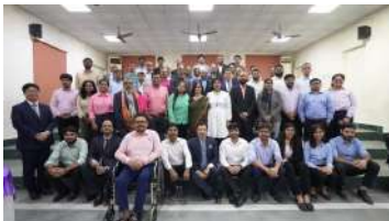
Group photograph of Roundtable Discussion

BusExe – Business Excellence, in collaboration with DMA and FMS, University of Delhi, hosted a round table on 21st September 2024 at the FMS campus on “Navigating the Future of Supply Chains for Agility, Resilience, and Sustainability.”