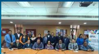
Members of Management Committee