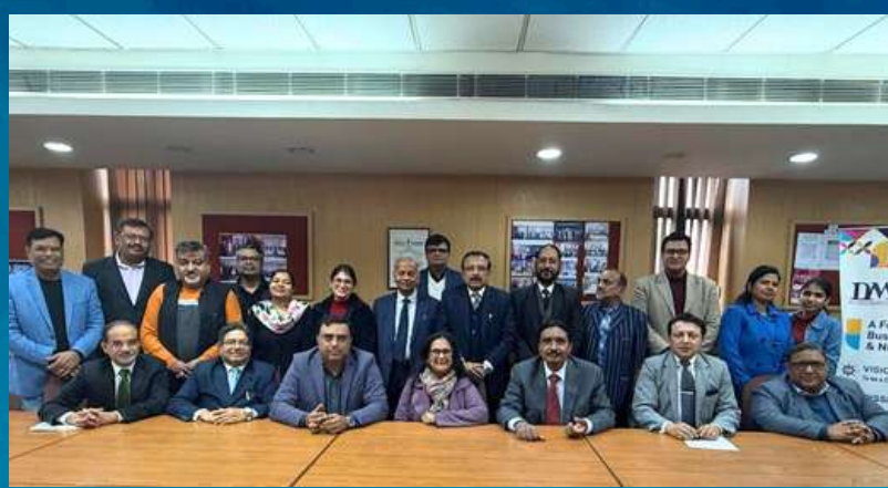
Members of Managing Committee